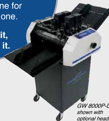
GW 8000P-DS shown with optional heads.